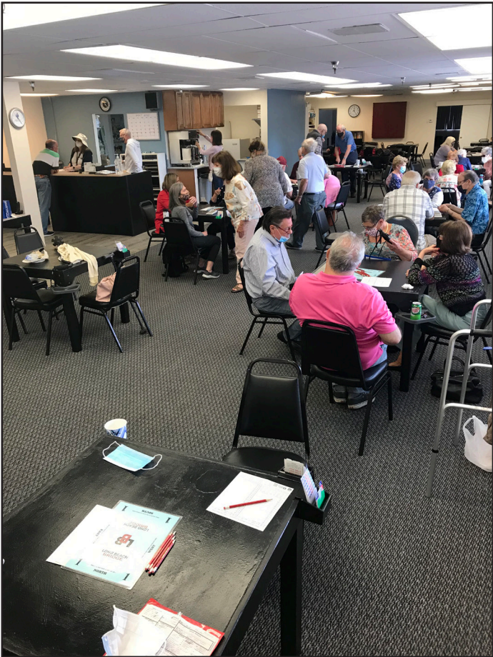
Monday, 31 May Game