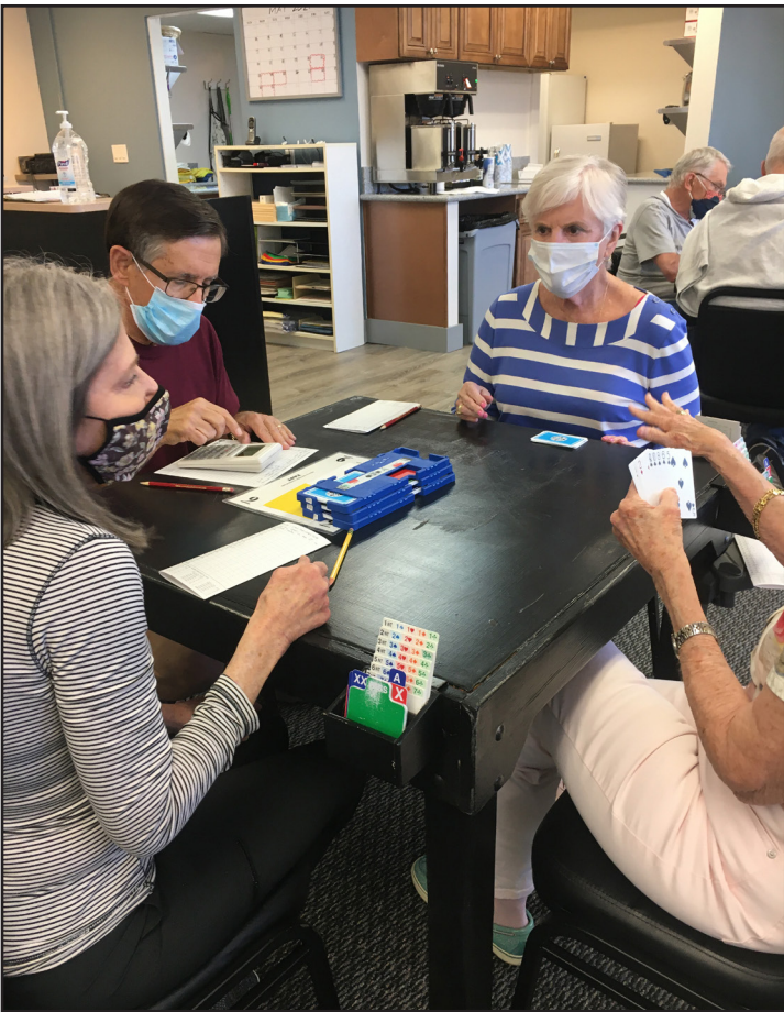
Reopening Day Players