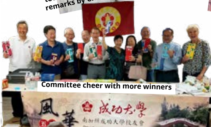
Committee cheer with more winners