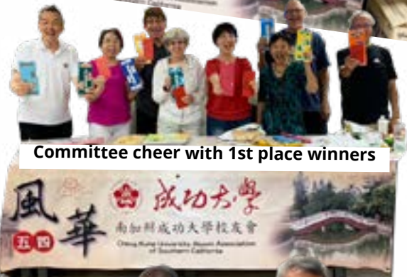
Committee cheer with 1st place winners