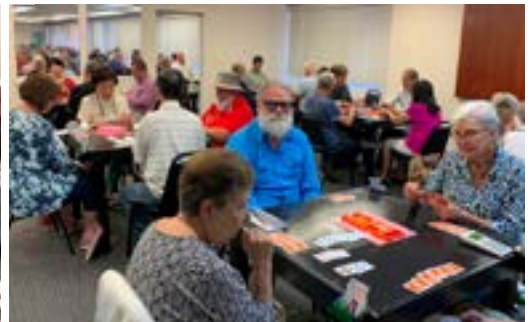
A full house for the CKUAASS Tournament! Twenty-two tables resulted in over $800 donated to Long Beach Bridge.