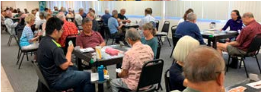
CKUAASC Committee donated tournament proceeds to LBBC and provided the amazing treats