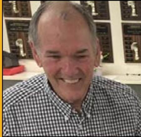
1st Place - Morning N/S Bill (not shown) and Jim Keese