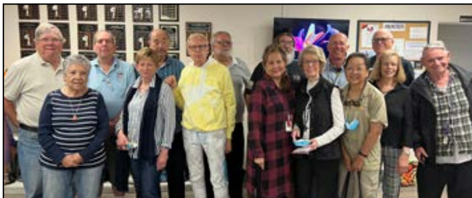
Some of the Masters that volunteered their time and expertise.