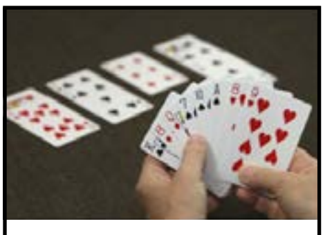
We all know that bridge has been linked to cognitive benefits for those at risk for dementia, including Alzheimer's, but did you know that card games such as bridge are great models for war games? Check out this article published by the Wall Street lournal to learn more.